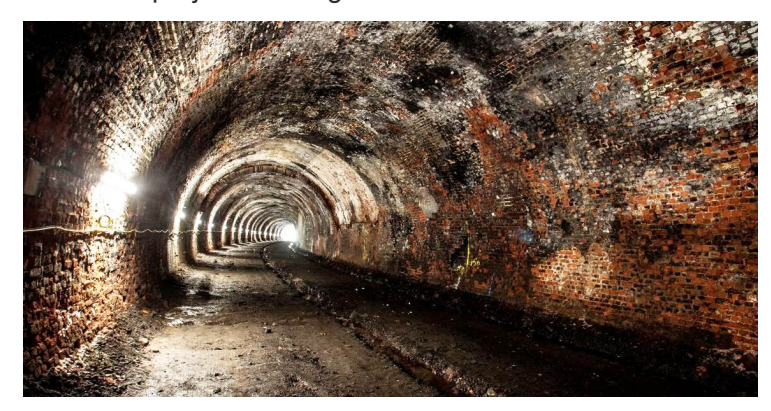
The Borders Railway Project acheived an 'Excellent' (87.1%) Interim Client & Design Award.

As with any Whole Team Award assessment, the multipackage approach still allows for the use of an Interim Client & Design Award, enabling project teams to add a verified Assessment during the Design stage of a Whole Team Award. It is possible to combine the Interim Client & Design Award assessment and multi-package assessments in any combination that suits the manner in which the project is designed and constructed.