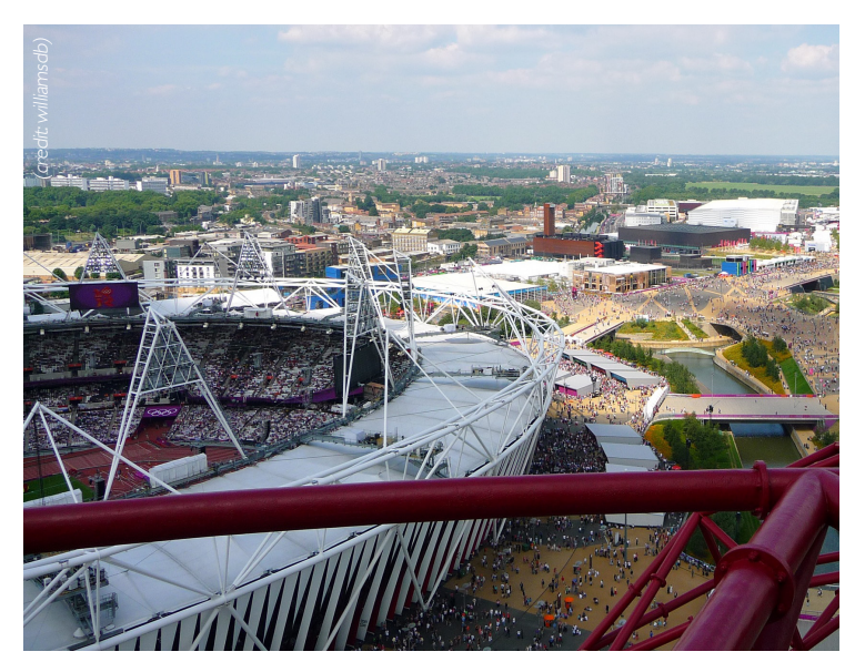
The multi-package assessments at the Olympic Park scored between 75.2% and 94.7%. The overall weighted score was 93.8% ('Excellent').

Given the complexity and scale of the overall project, the multi-package assessment approach proved to be essential and still provided an overall project score for all assessments combined. The assessments were aggregated on a construction-value weighted basis, giving an overall weighted 'Excellent' CEEQUAL score of 93.8%.